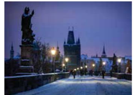
The statue of Augustine of Hippo on the Charles Bridge in Prague

A mystery is a truth of our faith that we can explore, but never fully understand.