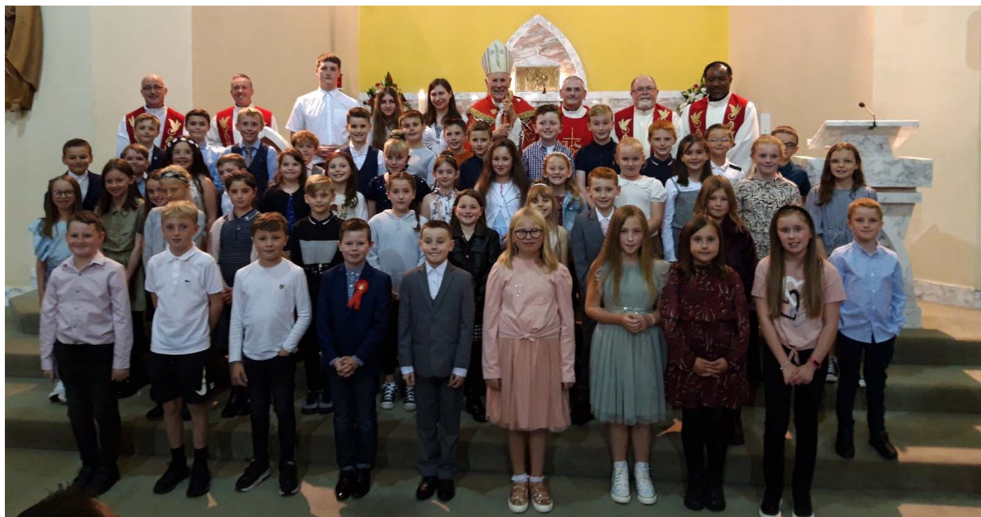
Congratulations to the young people who received the Sacrament of Confirmation on Thursday 23rd September.

ST MATTHEW'S YOUTH HUB: The Hub will be restarting in September 27th from 6-8pm. It is open to any young person who is in Secondary School. The Youth Hub Leader will be one of the Salesian Sisters who will run the sessions helped by our own volunteers.