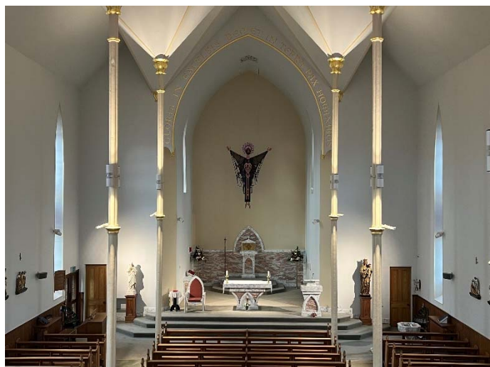
St Joseph's church, October 2022