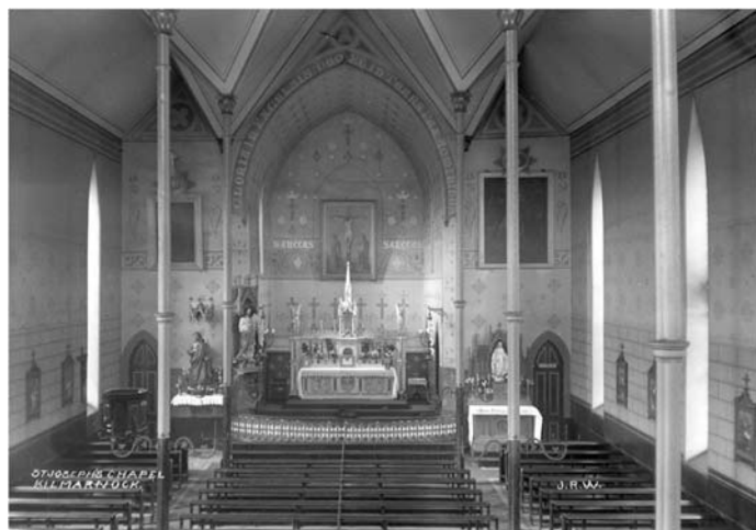
St Joseph's church, around 1907

The photograph from around 1907 probably displays a number of original features of the 1847 church, and the 2022 redecoration acknowledges a few of these features in a contemporary way. The livestream on YouTube will resume from this weekend.