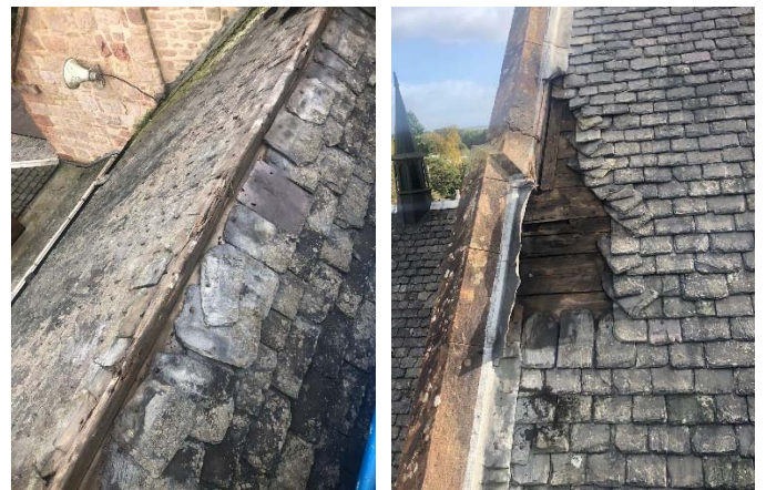
Recent church roof repairs