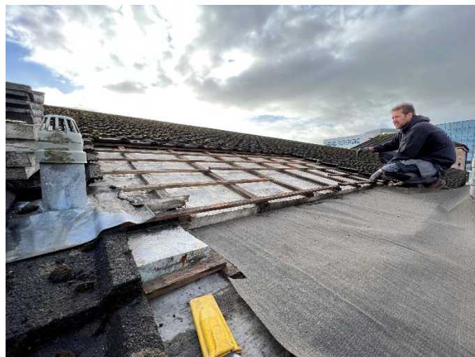
Hall roof repairs undertaken this week (an area of about 5 metres x 3 metres)

Thank you for the donations this week of £1000, £100 and £40.