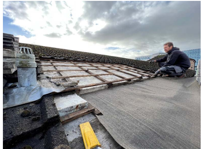
Hall roof repairs undertaken last week (an area of about 5 metres x 3 metres)

Thank you for the donations this week of £1000, £1000, £500, £250, £100 and £100, and all other donations to the Building Fund which are directed to the Special Maintenance Fund.