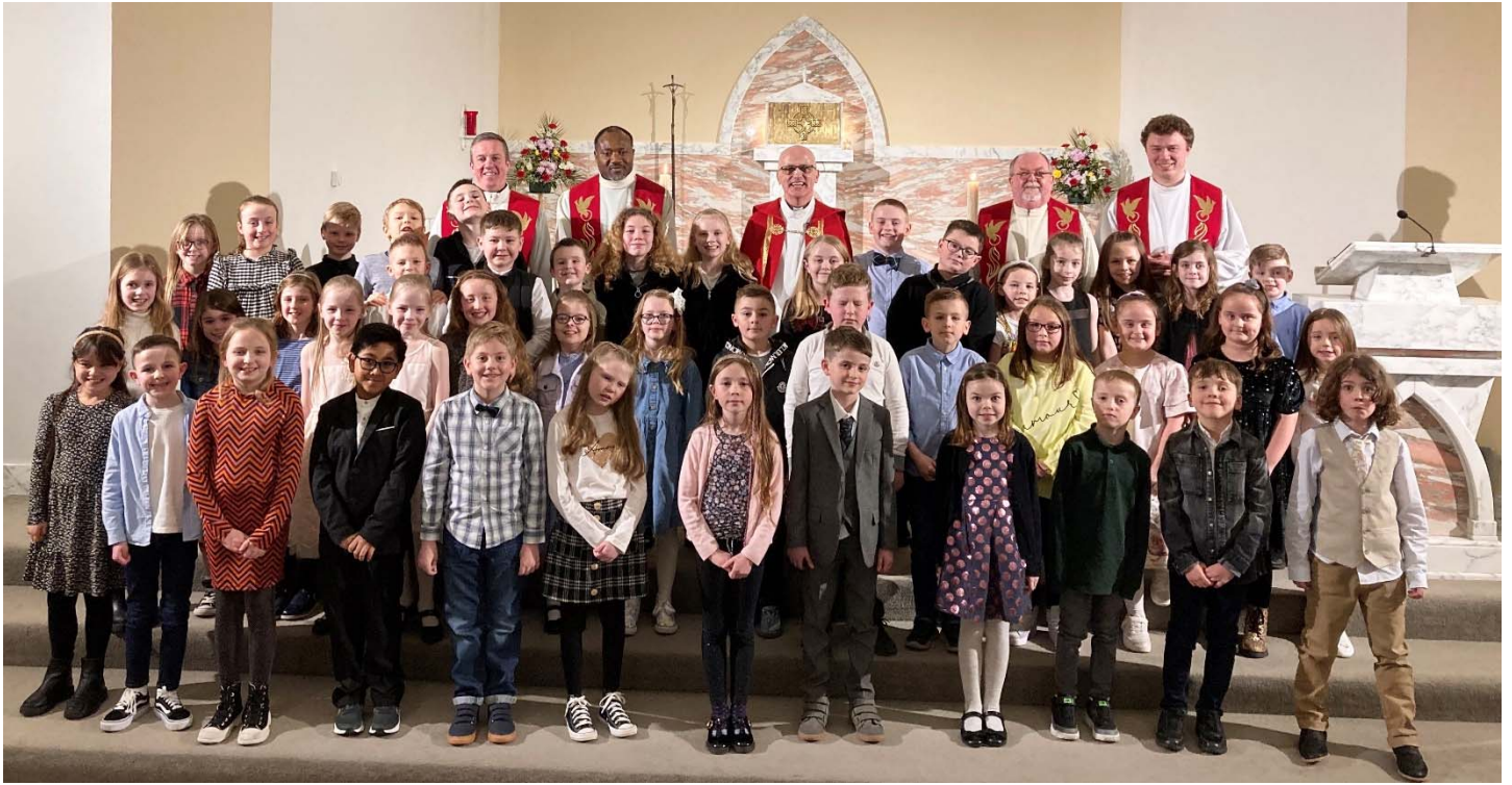
Congratulations to the young people of St Joseph's Deanery who received the Sacrament of Confirmation on Thursday 16th February in St Joseph's Church, Kilmarnock. May the Holy Spirit strengthen them to be faithful disciples of Jesus.

WORLD YOUTH DAY: During the summer three young people from our parish will embark on a pilgrimage to Lisbon, Portugal to celebrate the World Youth Day with Pope Francis and young people from across the world. As well as raising our fare, we are trying to raise the fare of a young person from a mission country. In order to do this we have planned a fundraising Quiz Night and Raffle.